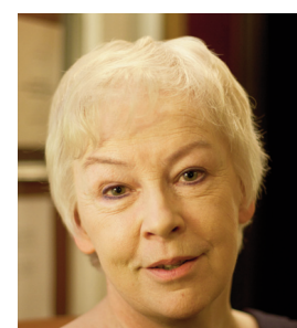
Denise Riley

Painter and printmaker Eileen Cooper RA studied at Goldsmith's College and Royal College of Art, London. She was appointed Keeper of the Royal Academy Schools in 2011, the first female officer of the RA since it was founded in 1768. She has had solo exhibitions at Air Gallery, Benjamin Rhodes Gallery and the Dulwich Picture Gallery (all London); Castlefield Gallery, Manchester; Artsite, Bath; and Glasgow Print Studio. Eileen Cooper at 50 was shown at Art First in London and New York. Her work has featured in many group and international touring exhibitions including: The New British Painting ; The Outsider: British Figuration Now ; Picturing People and Innocence and Experience . She has been represented by Art First since 1997